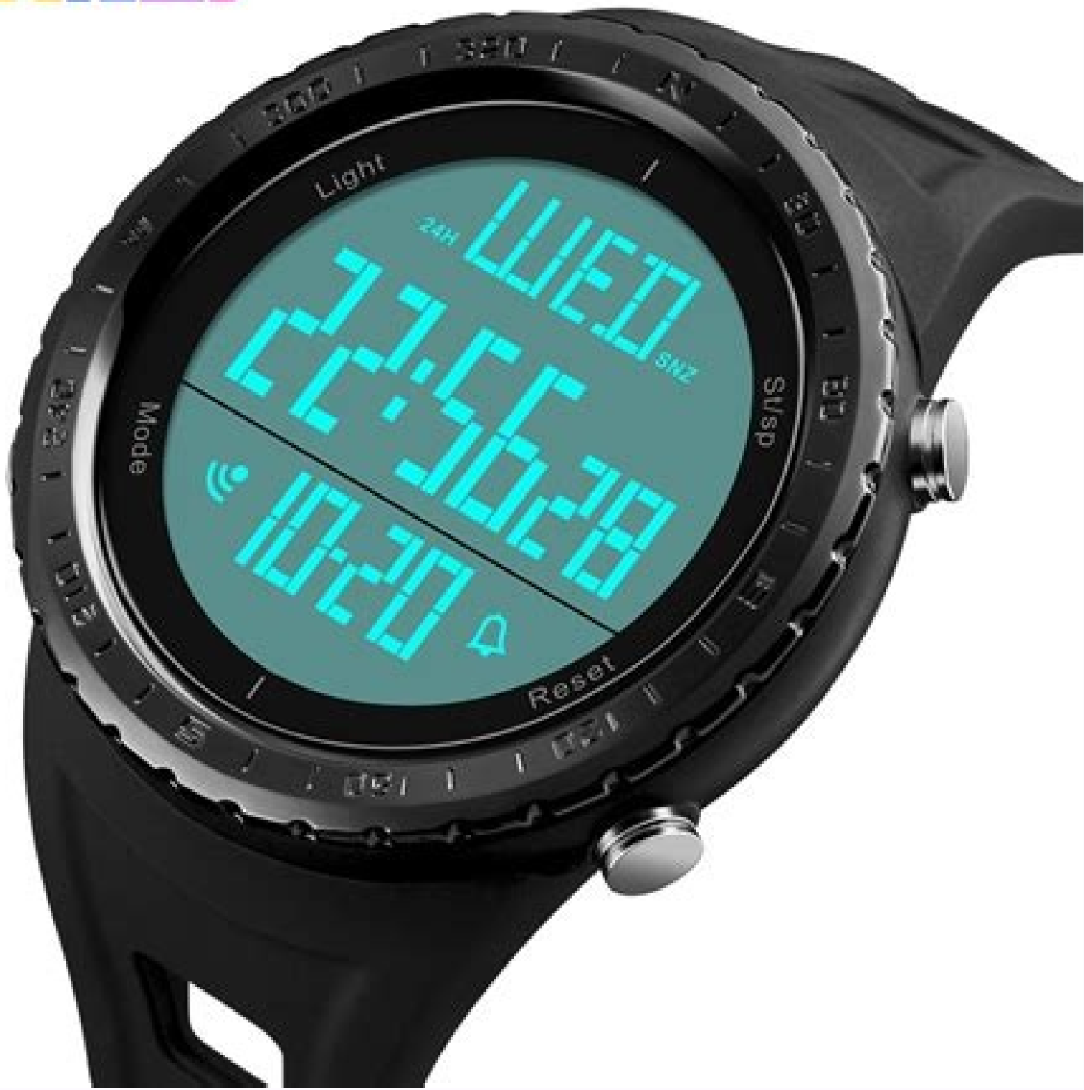
Armitron 45/7041 instruction manual. Armitron 45/7042 instruction manual. Armitron 45/7034 manual.