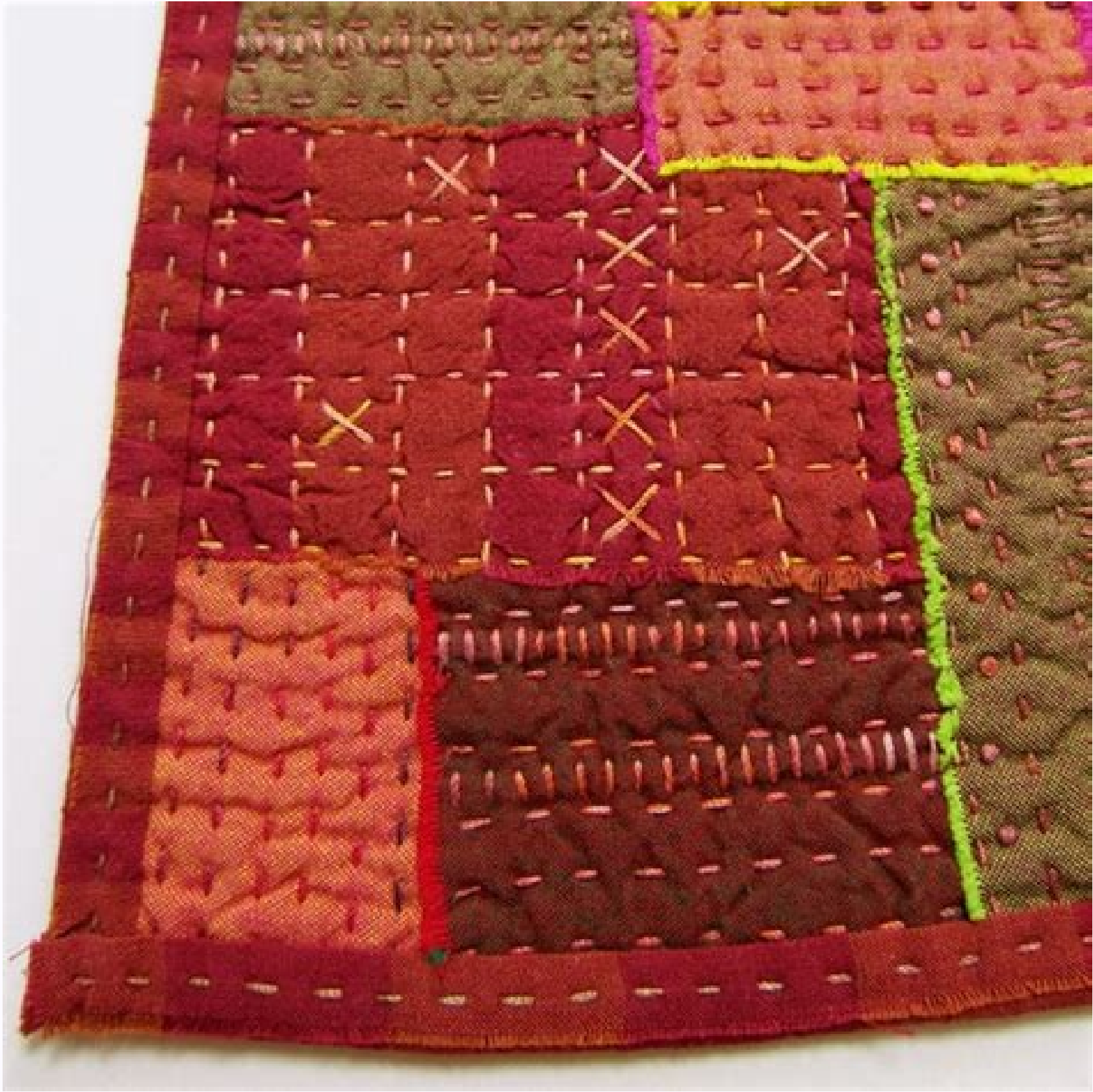
Remnant bell puzzle. Remnant bells.