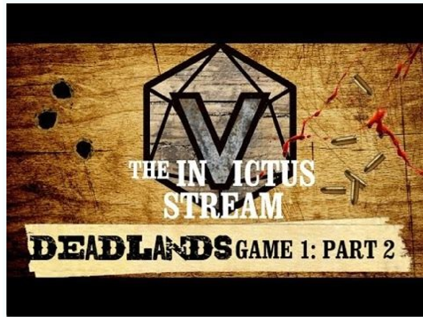
Deadlands rpg. Deadlands rpg pdf pt br. Deadlands rpg pdf.