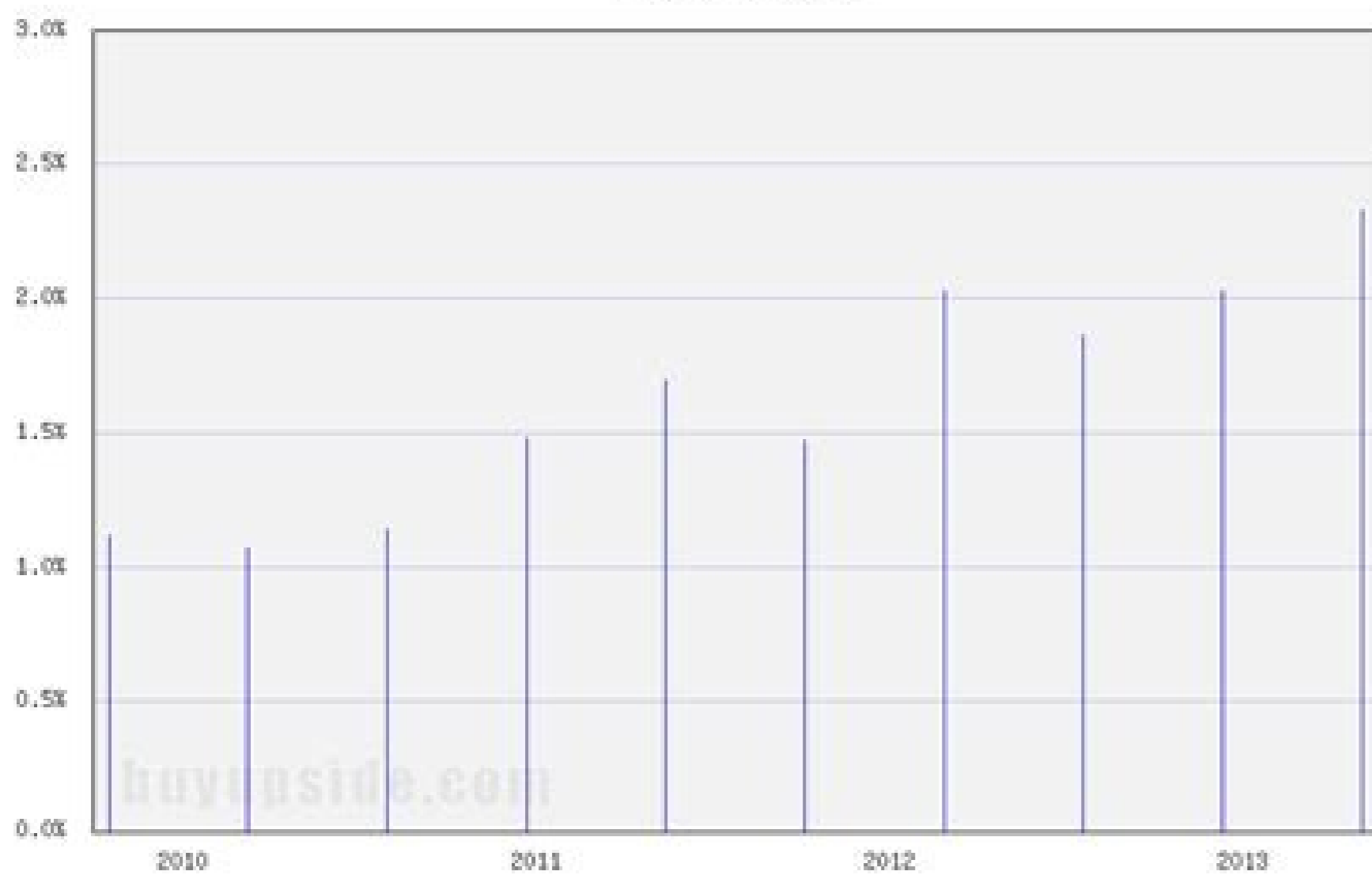
Dividend Yields Quote symbol: BVCO 12/2010 - 03/2013