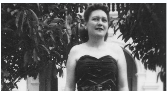
Anthony burgress earthly powers review. Anthony burgress earthly powers deutsch. Anthony burgress earthly powers amazon.