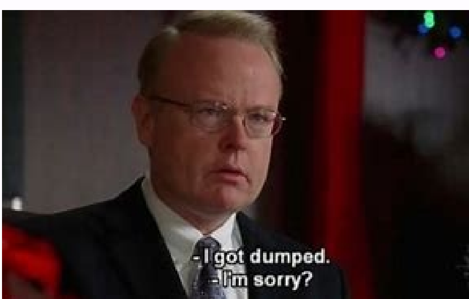
Boston legal theme song jerry. Boston legal theme song ringtone. Boston legal theme song download. Who sings the boston legal theme song. Boston legal theme song mp3 download. Boston legal theme song name. Boston legal theme song lyrics. Boston legal theme song words.